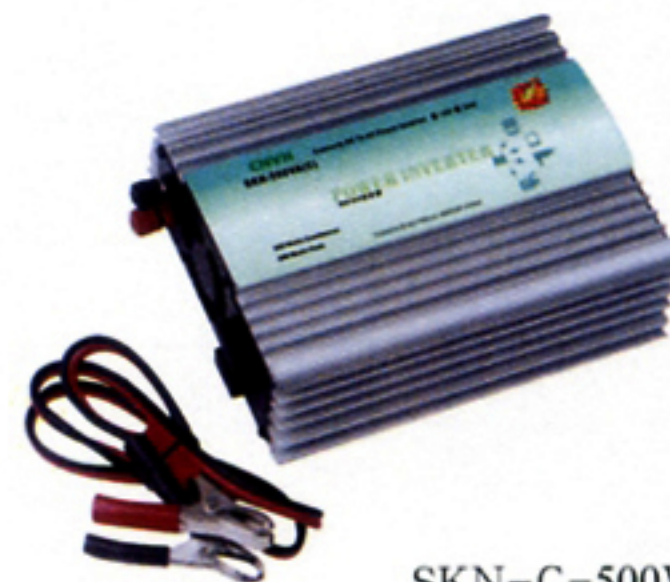
SKN-C-500W Rated power: 500W Peak-value power: 800W