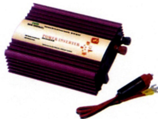
SKN-C-350W Rated power: 150W Peak-value power: 600W