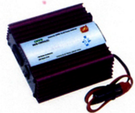
SKN-C-150W Rated power: 150W Peak-value power: 330W